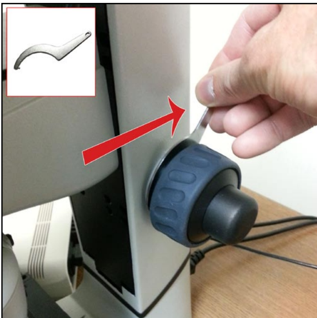
fig. 1. Turn sleeve clockwise to tighten.

If the focus knobs need to be tightened refer to fig. 1 and if they need to be to have less tension refer to fig. 2 .